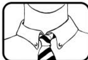
Loosen tight clothing