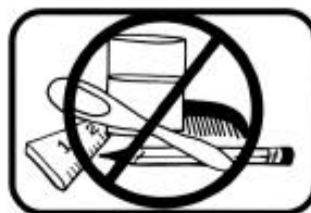
Don't put anything in mouth