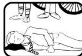
Turn on side