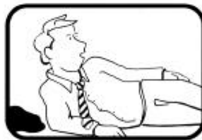
As seizure ends...