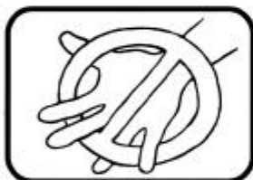
Don't hold down