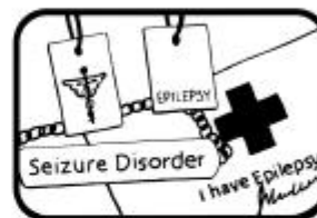
Look for I.D.