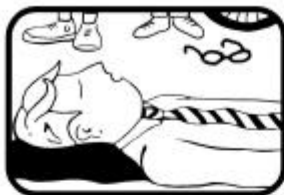
Cushion head, remove glasses